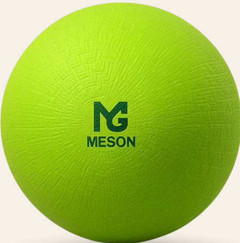
GG3600 GREEN GOLIATH