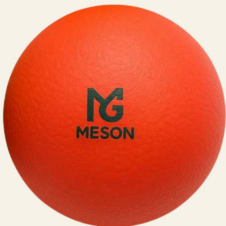
DB423 BLAZE BOMBER