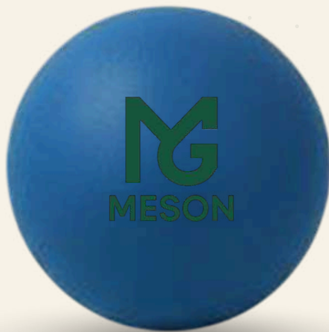
KB621 ROYAL ROCKET