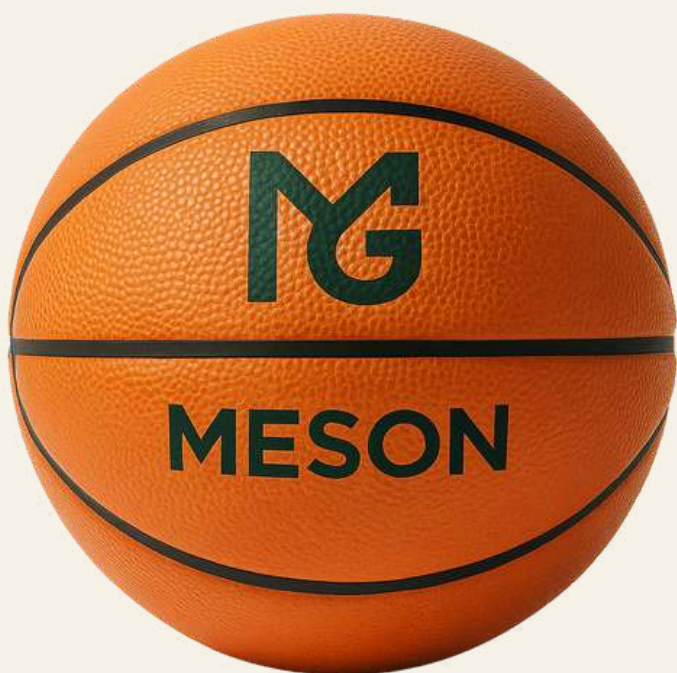
BB144 CLASSIC BALL