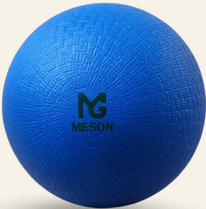
GG2700 BLUE BOMBER