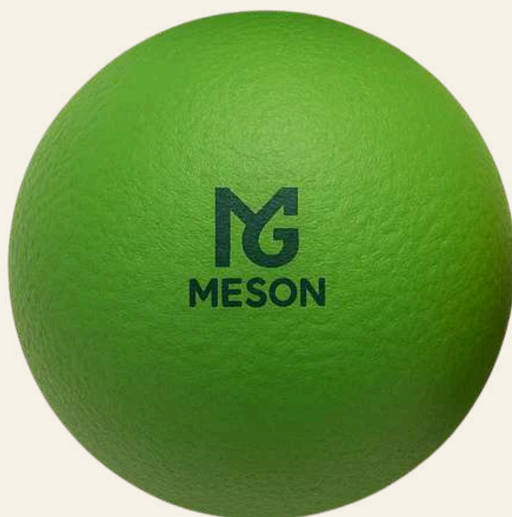
DB441 EMERALD CRUSHER