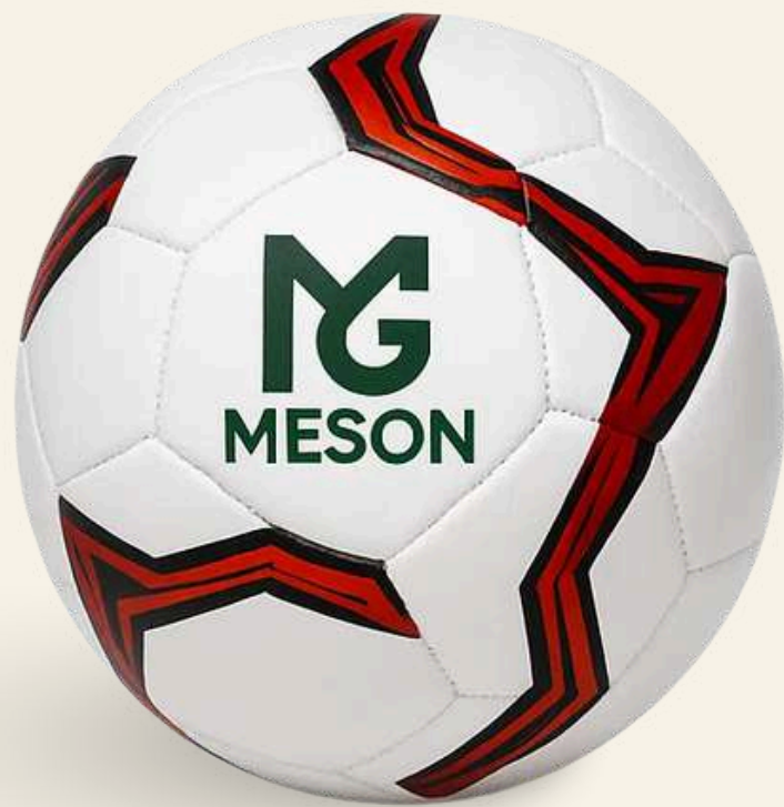
SC234 ATTACKER BALL