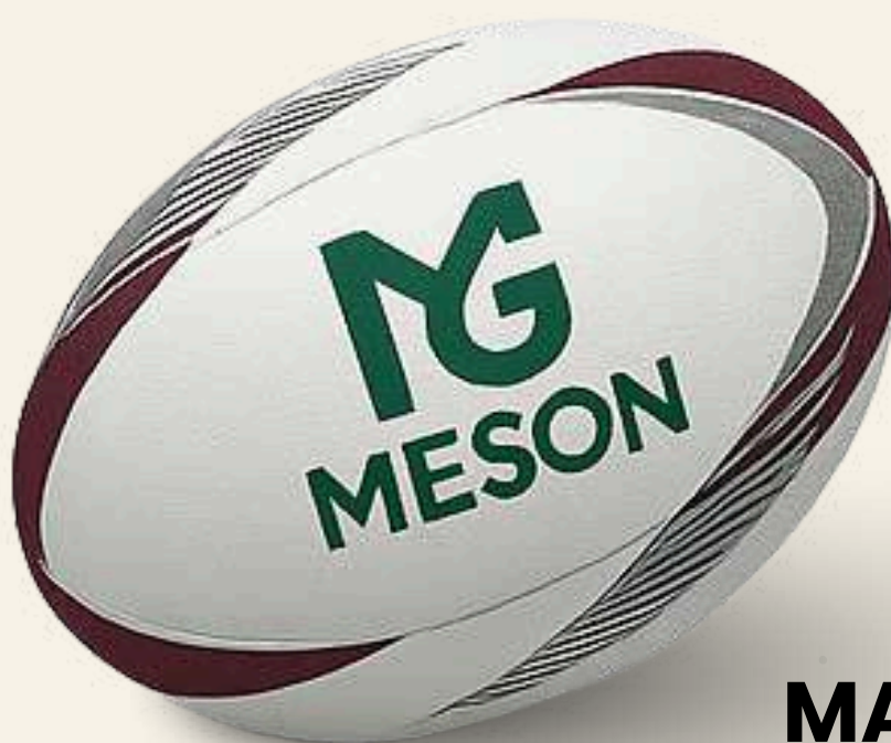
RG342 MAROON MAULER