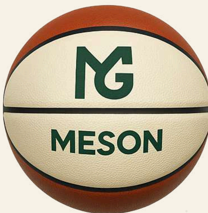
BB171 RETRO BALL