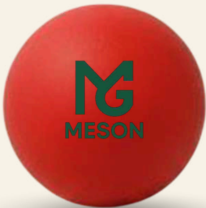
KB612 CRIMSON KICK