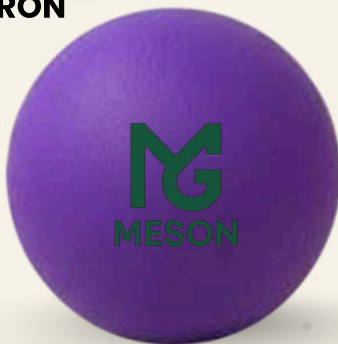
KB1170 GRAPEVINE GOALIE