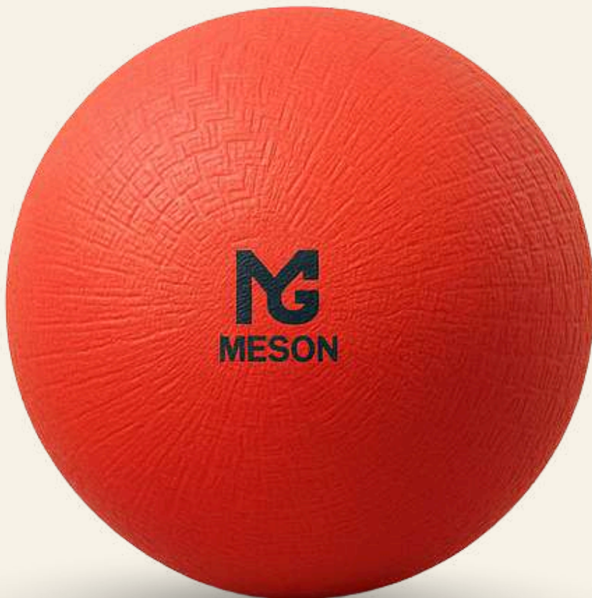
GG5400 CRIMSON CRUSHER