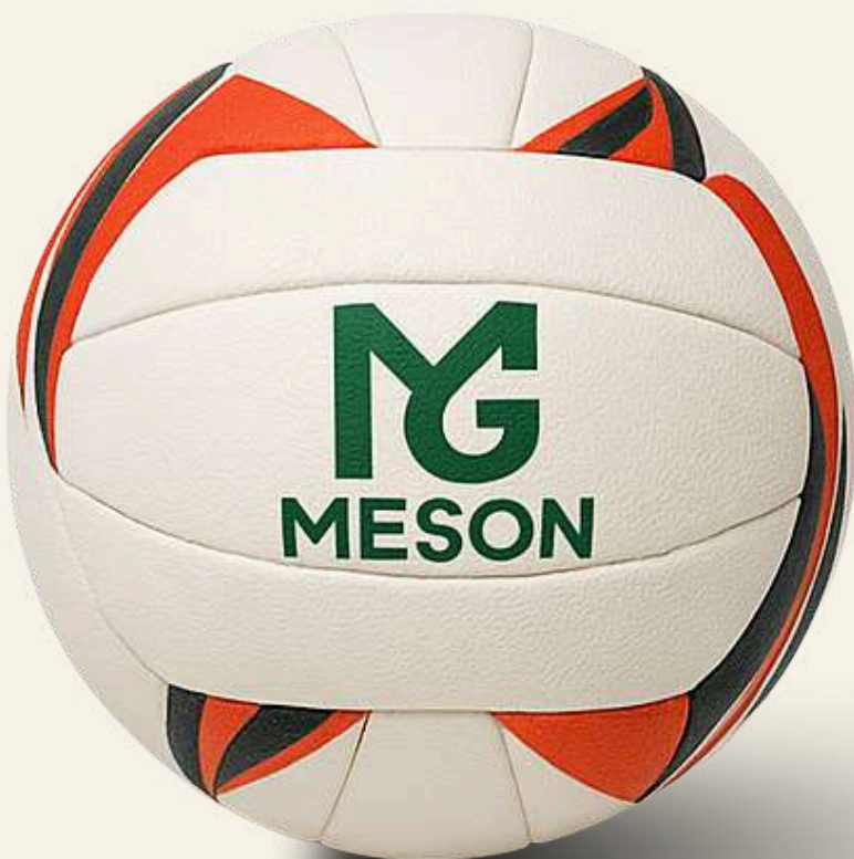
VB315 CRIMSON SPIKE