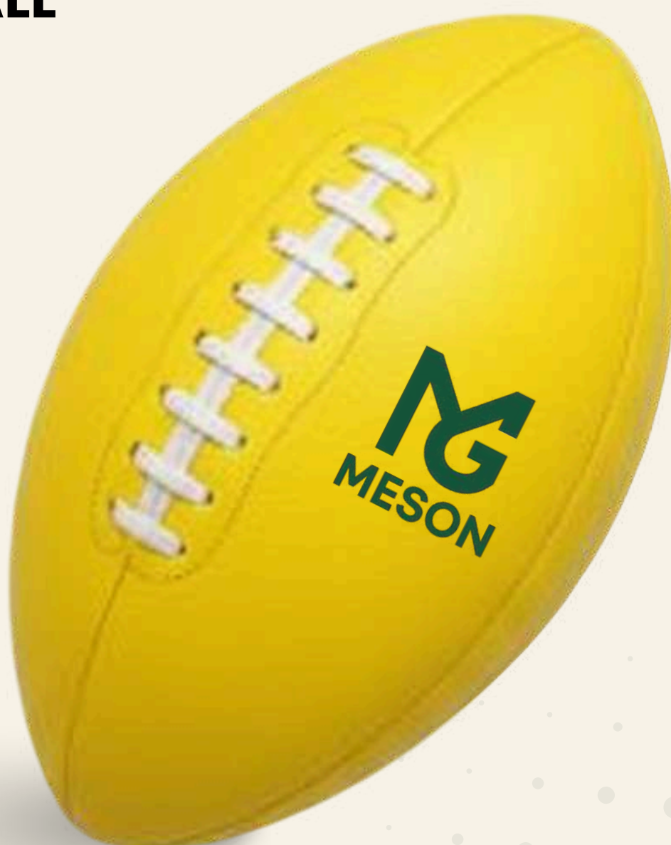
AMF126 CHAMPION MINI BALL