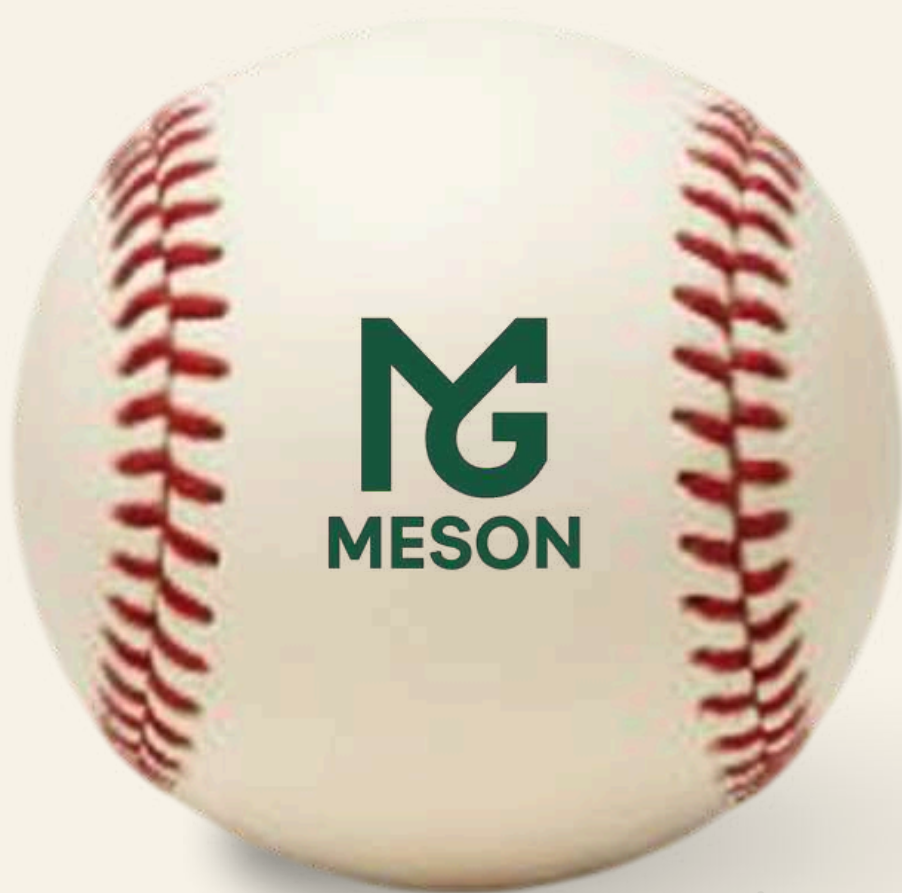
BB207 PRO BASEBALL