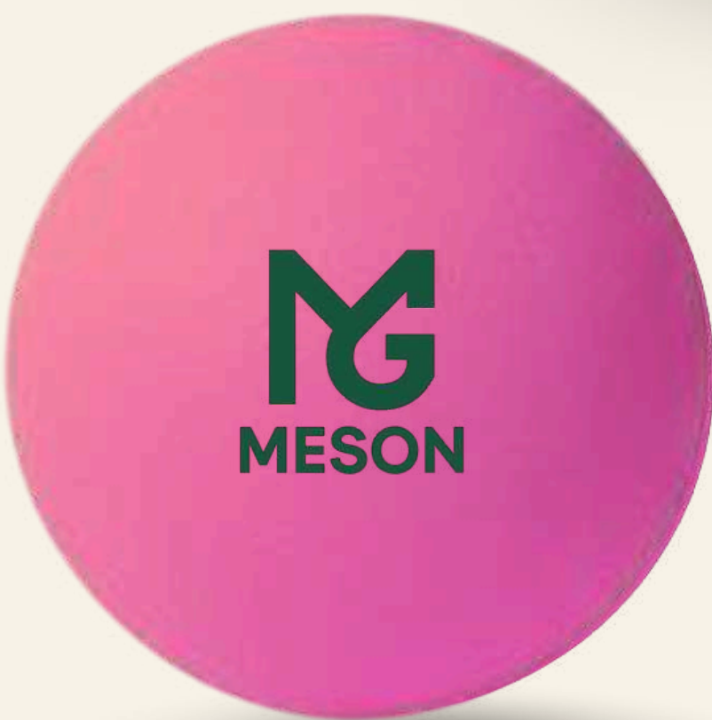
FQ900 FUCHSIA FLYER