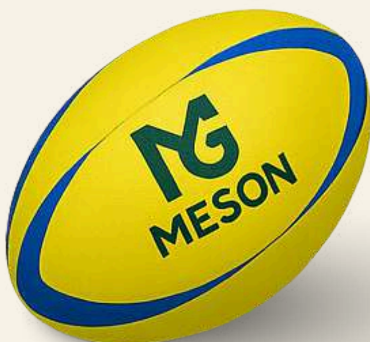
RG360 SUNBURST IMPACT