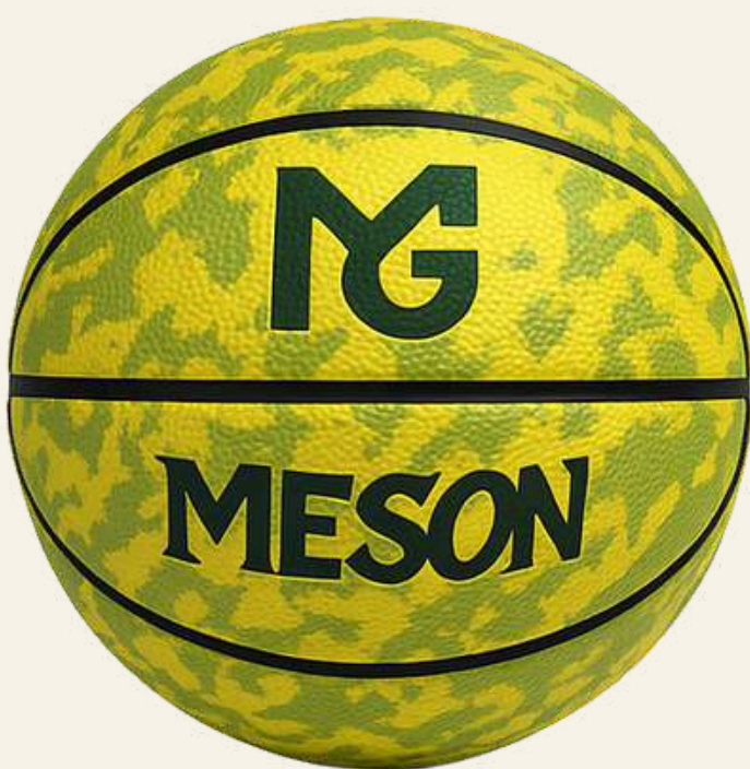
BB162 CAMO BALL