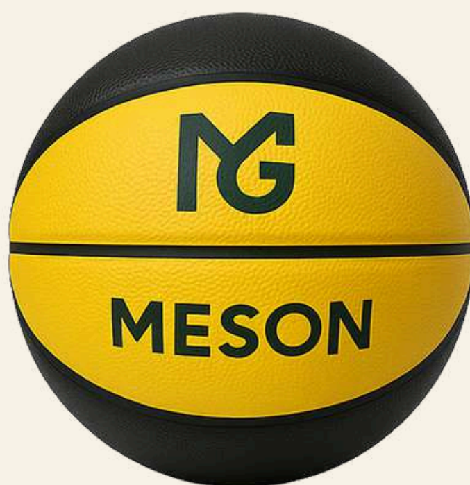
BB153 DUAL TONE BALL