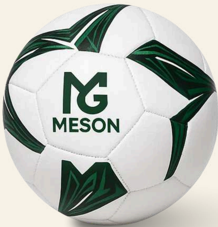
SC225 STRIKER BALL