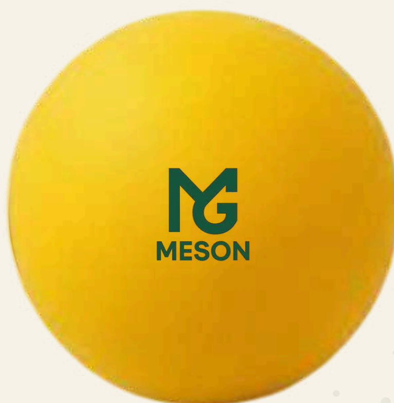
DB603 GOLDEN IMPACT