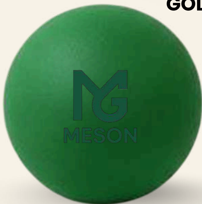
KB702 EMERALD EXPRESS