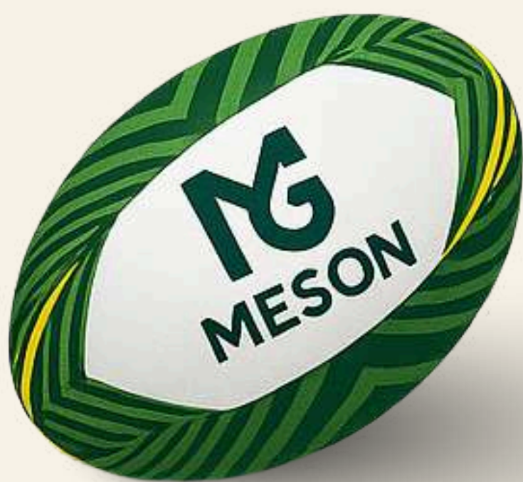
RG405 FOREST FURY