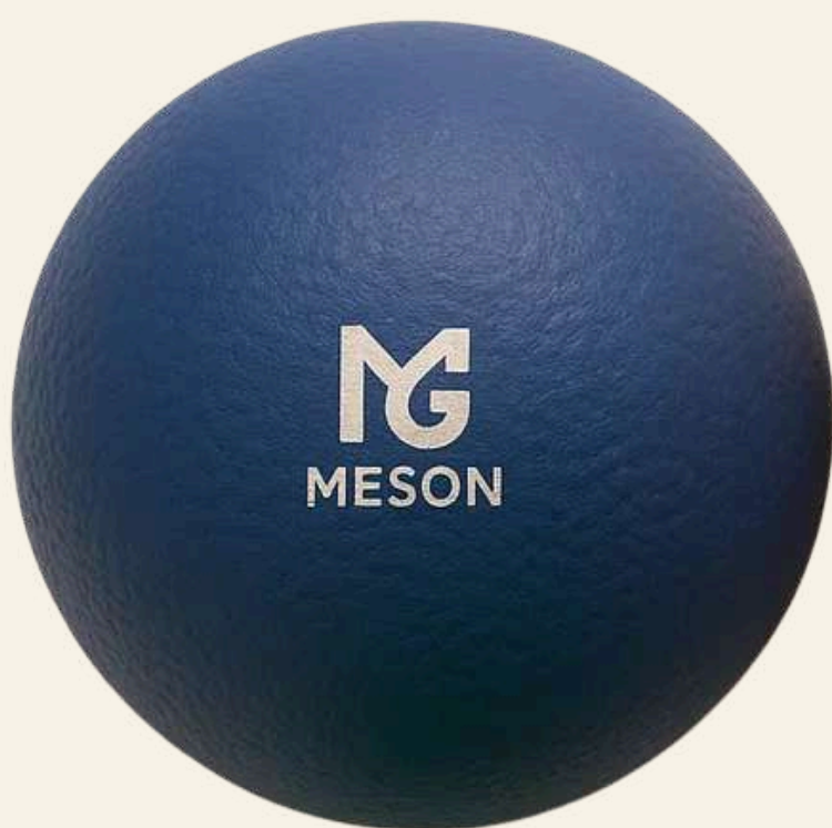
DB540 COBALT CANNON