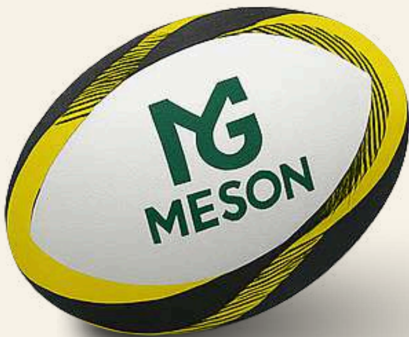
RG333 VOLT IMPACT