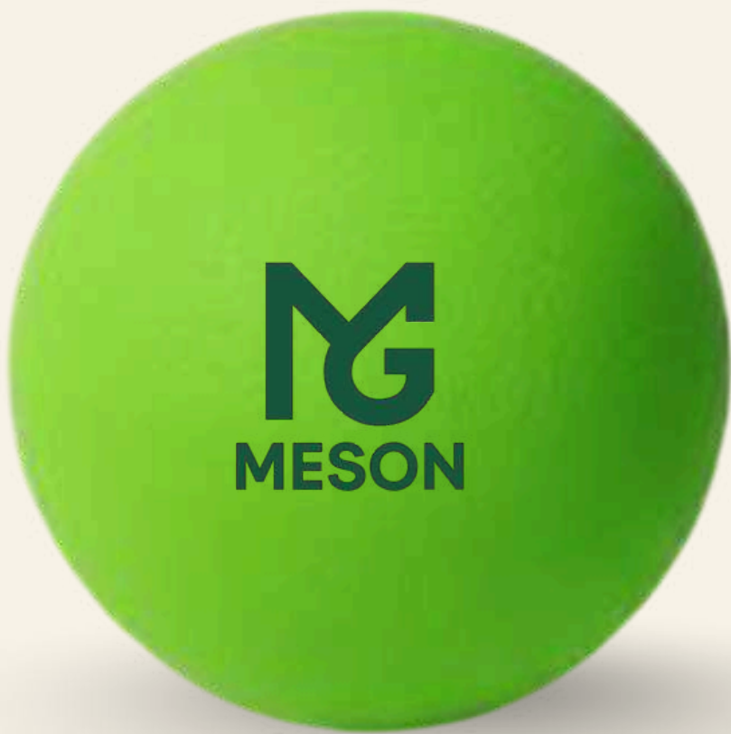
FQ1080 LIME LAUNCHER