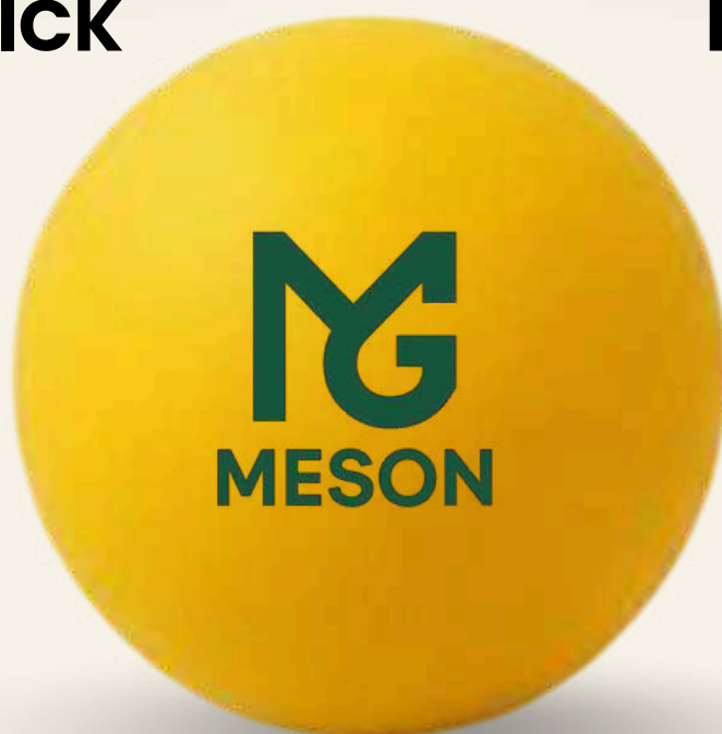
KB630 GOLDEN GRIDIRON