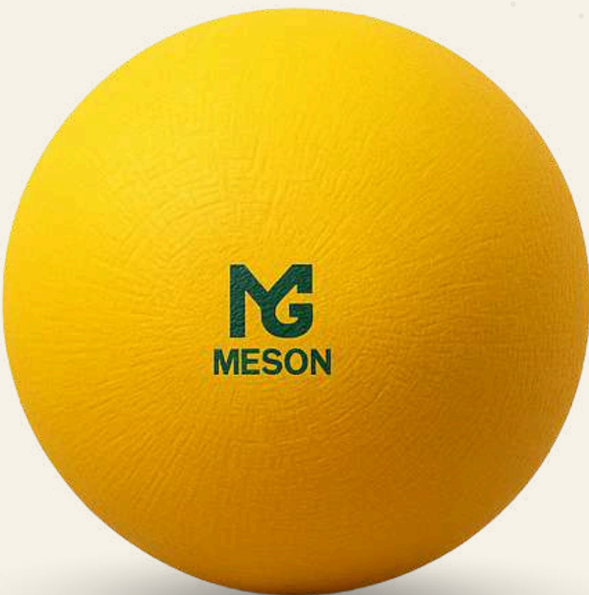
GG4500 GOLDEN GAUNTLET