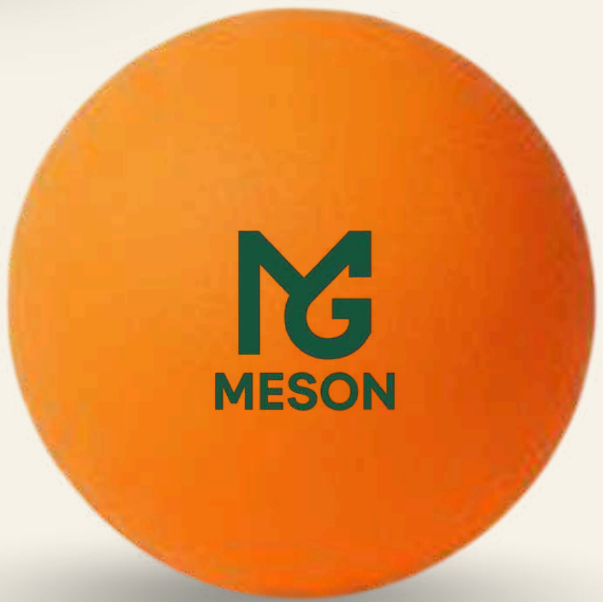
FQ8100 TANGERINE TOSS