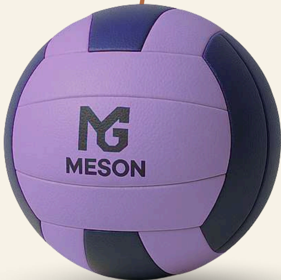
TB7200 VIOLET VORTEX