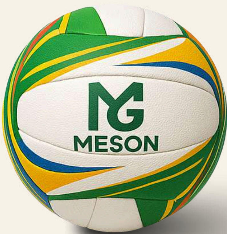
VB270 VIBRANT VOLLEY