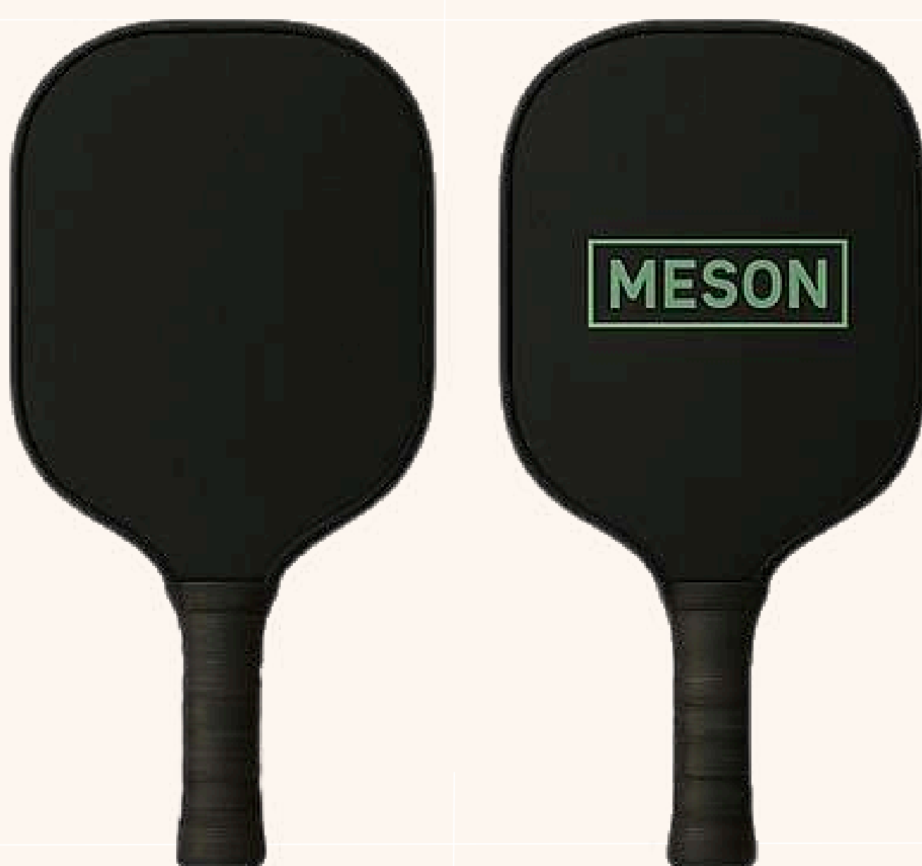
PC450 BLACK HAWK