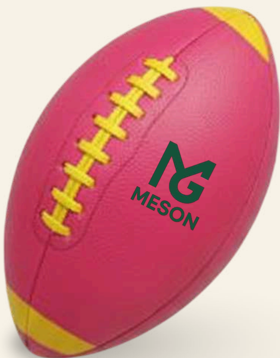
AMF108 POWER MINI BALL