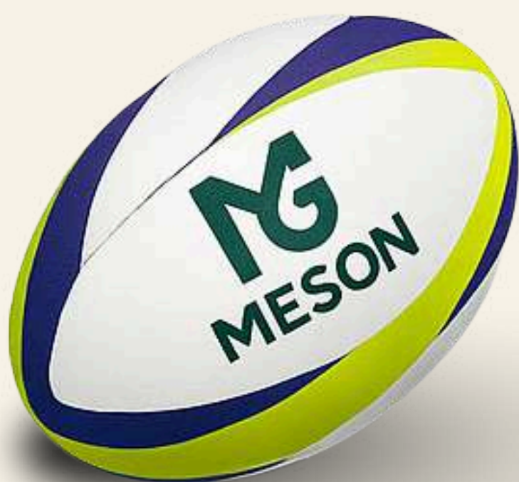
RG351 ROYAL BLITZ