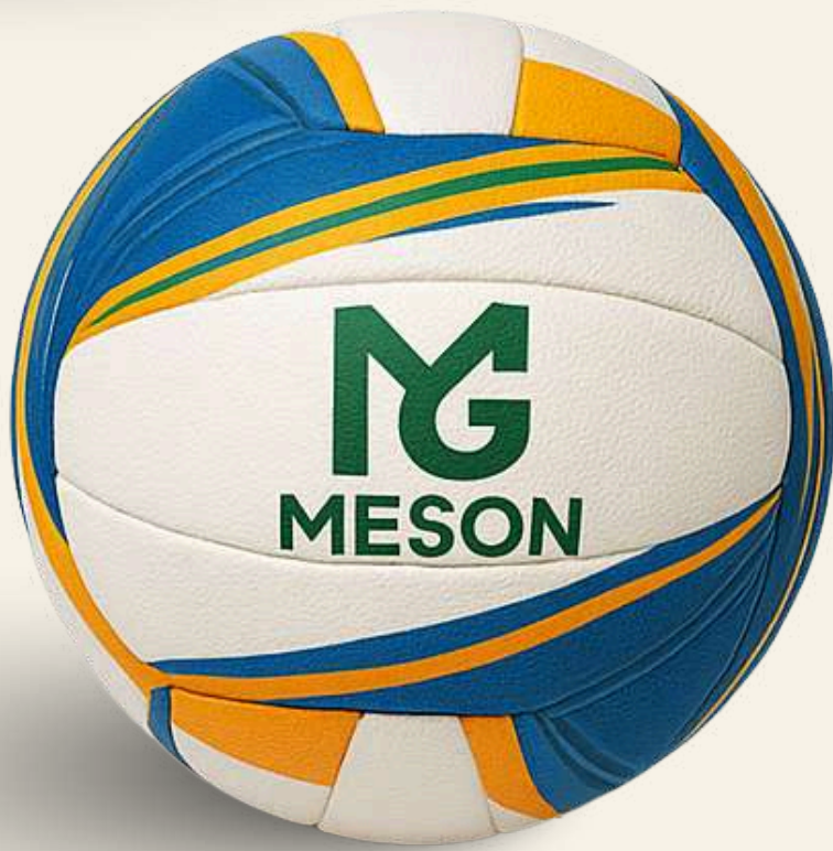
VB306 AZURE ACE