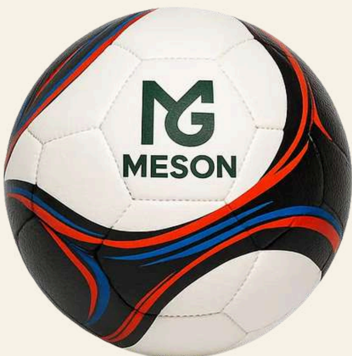
SC243 CHAMPION BALL