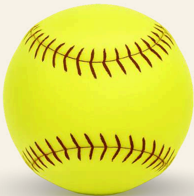
TS4200 OPTIC YELLOW