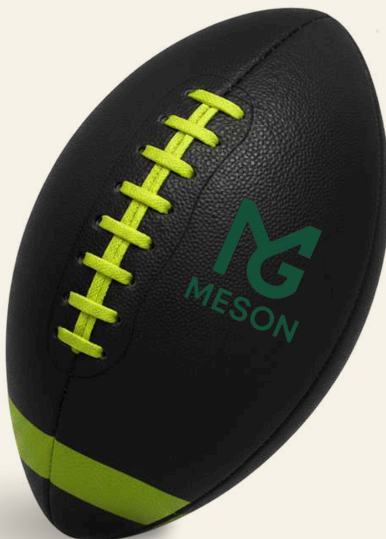
AMF117 NEON MINI BALL