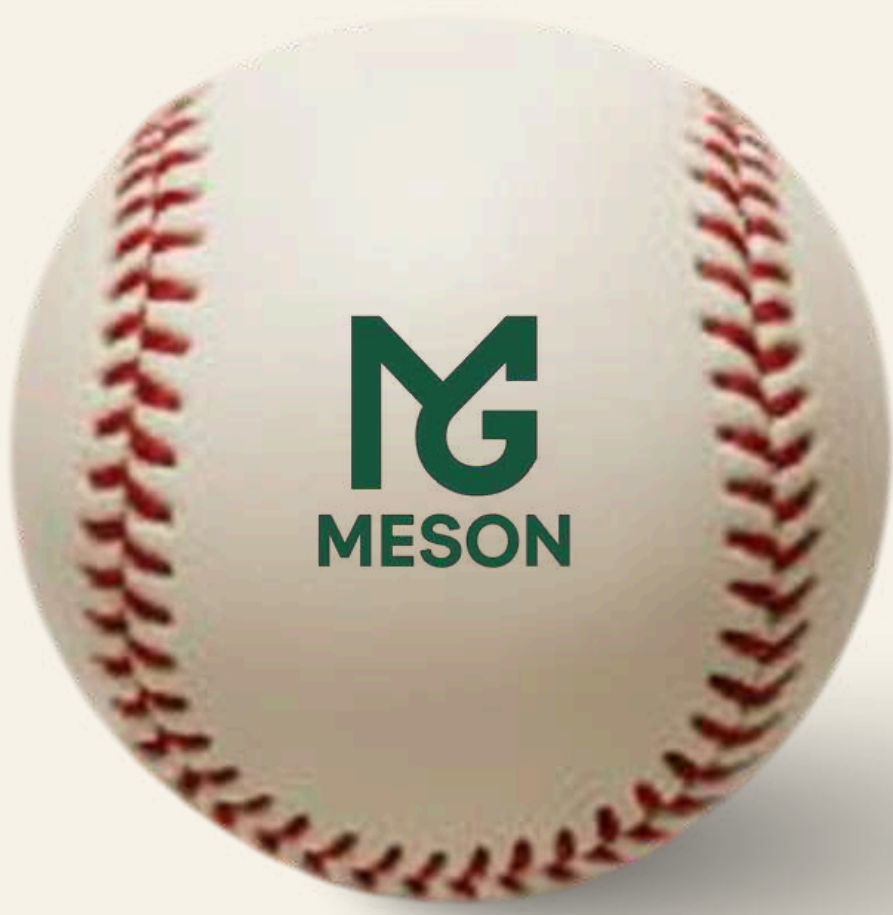
BB180 CLASSIC BASEBALL