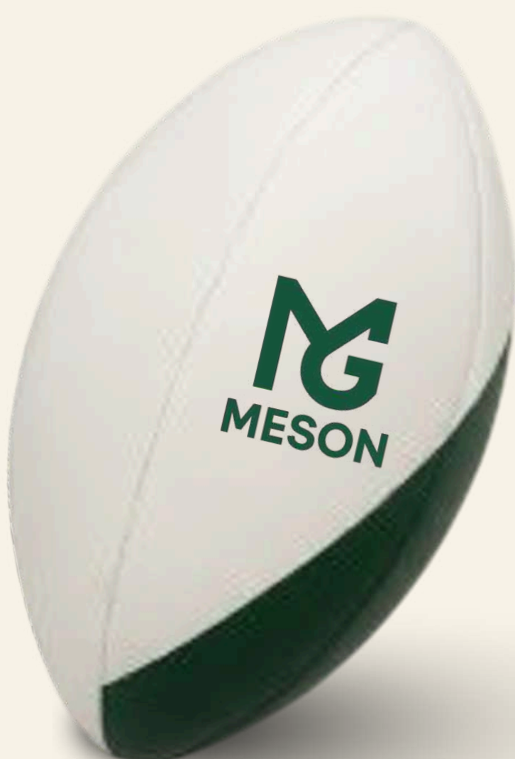
AMF135 CLASSIC MINI BALL